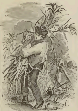
SUN PRINT, SUFFOLK.