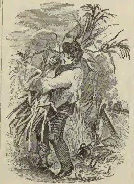
Sun Print, Suffolk, Va.